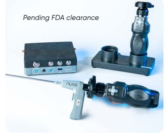
NUVIS® Wireless Camera System