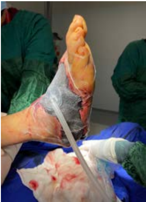
Figure 3: Negative pressure wound therapy installed on the third postoperative day.