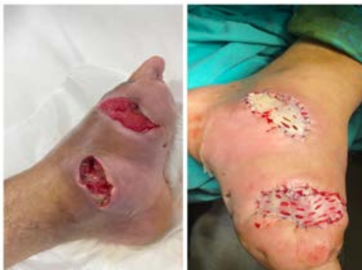
Figure 9: Photo of the follow up visit and, after the graft.