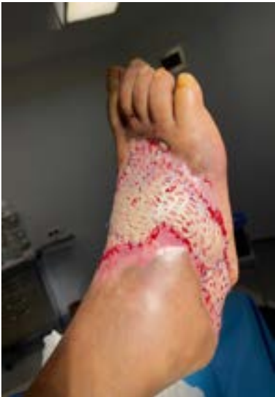
Figure 4: Grafting 4 months after the initial operation.