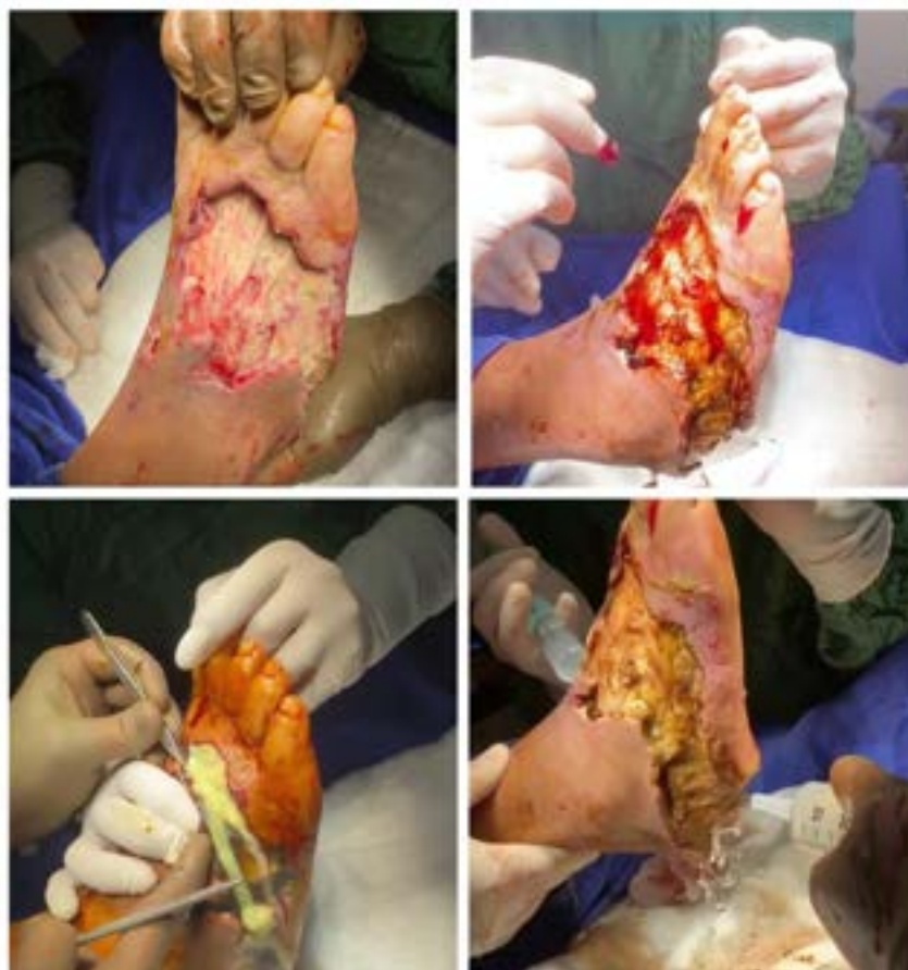
Figure 2: Surgical debridement, and application of topical desiccating agent (right upper photo).