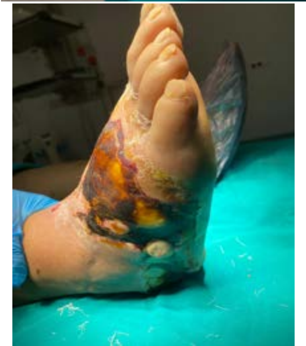
Figure 1: Upon admission.