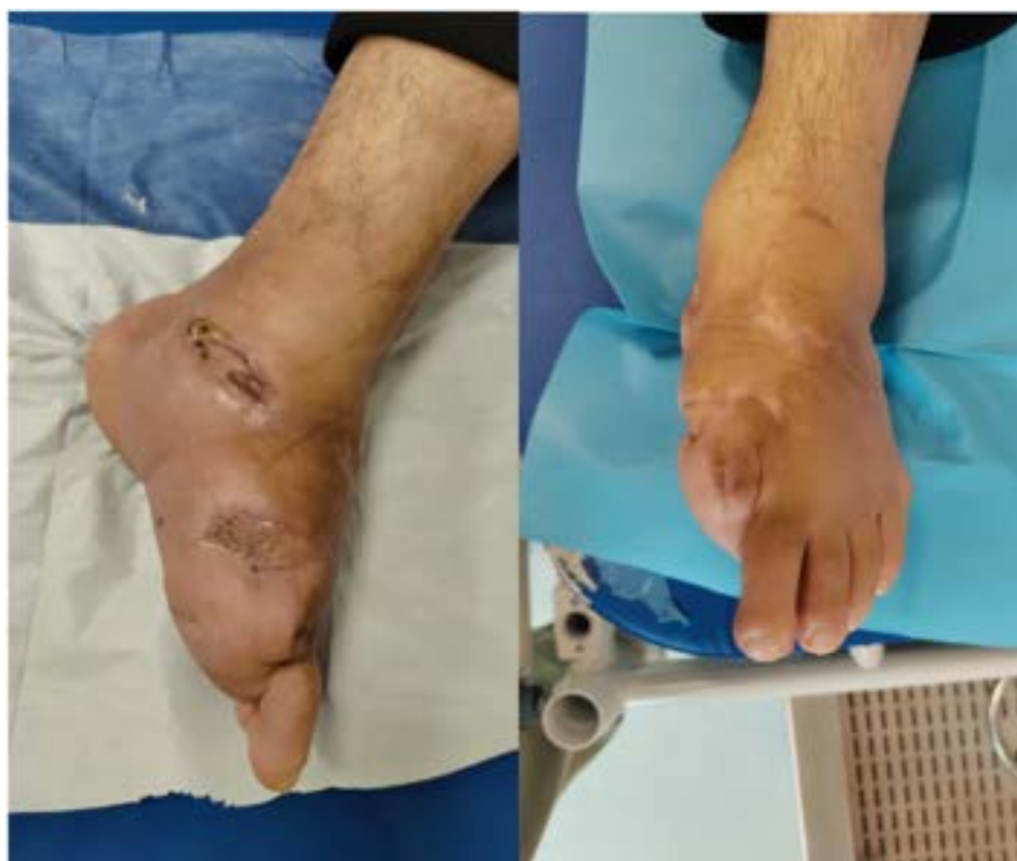
Figure 10: Photos of Follow-up 2 months after grafting.