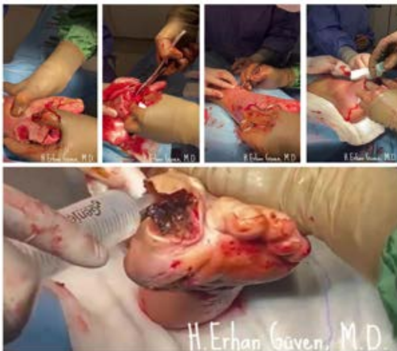
Figure 7: Intraoperative.