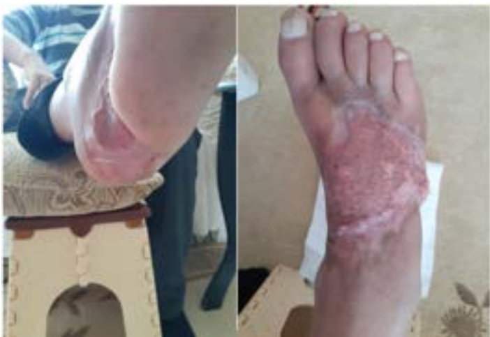
Figure 5: Healed Wound, 2.5 months post-operative. (2.5 months post-grafting).

Case 2: A 61-year-old male was referred to the general surgery department from the infectious disease department for treatment of a bullous lesion on the medial dorsal surface of the left foot. His medical history included diabetes mellitus, hypertension, cataract surgery in 2016, and cessation of smoking 25 years prior. Upon admission, the physical examination revealed purulent discharge from the wound suggestive of a deep infection. His lab work corroborated the physical findings: he had leukocytosis, and elevated C-reactive protein (Table 3, Figure 6). The patient underwent a metatarsophalangeal joint disarticulation (first toe amputation), metatarsal head resection due to osteomyelitis, drainage through a created skin tunnel and chemical debridement with a topical desiccating agent (Figure 7).