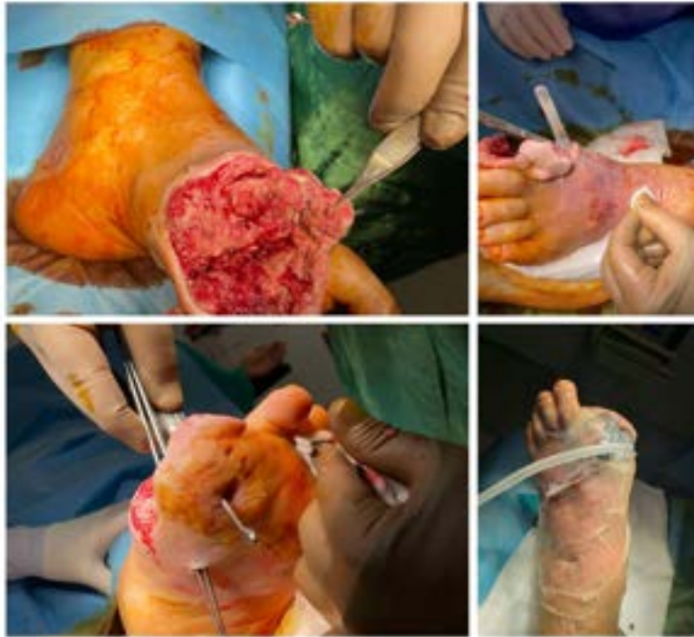
Figure 8: Day four of admission.

On post-operative day 4 debridement and irrigation were repeated in the operating room and, negative pressure wound therapy was applied (Figure 8). On post-operative day eleven debridement, partial suturing of the amputation defect was performed and negative pressure wound therapy continued. On post-operative day 21 the patient underwent total callus and ulcer excision in addition to delayed primary closure. All of his wounds were closed by post-operative day 35 and he was discharged from the hospital.